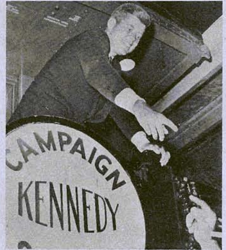
Senator Kennedy on campaign trail