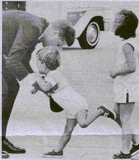
... a proud and devoted father