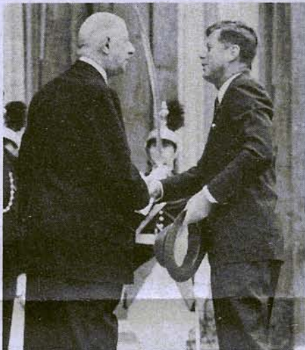
President Kennedy, a world figure