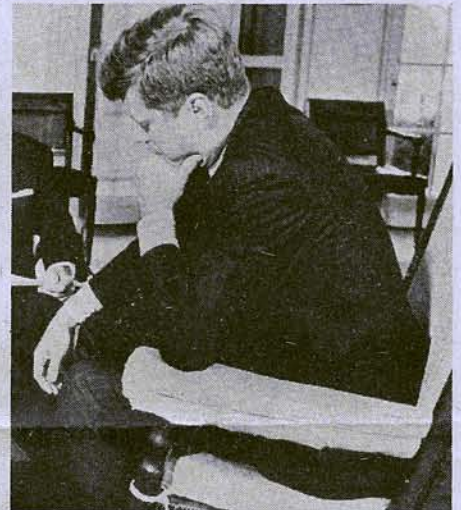
... and a man with heavy burdens