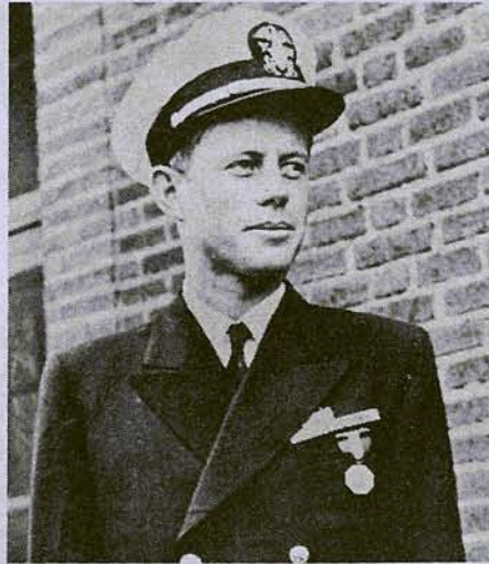
Lieutenant Kennedy—a Navy hero