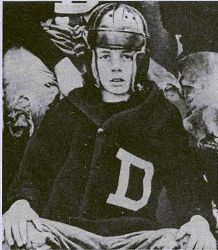
John Kennedy—the young athlete